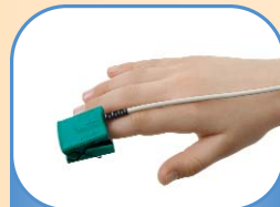
8000AP Pediatric Finger Clip (10 - 40 kg / 22 - 88 lbs)

Nonin has designed an array of PureLight reusable sensors – available for patients of all sizes (adult, pediatric, & infant) and clinical presentations. The 8000 Series of reusable sensors are ideal for short-term monitoring, stress testing and spot checks – any situation where the risk of cross-contamination is low. A comfortable sensor, each is designed for a specific application and is form-fitted to decrease ambient light interference.