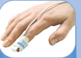
7000A Adult Flexi-Form II (> 30 kg / > 66 lb)

*Optional Reusable Sensor Extension Cables are available in 1m, 3m, 6m and 9m lengths.