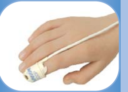
7000P Pediatric Flexi-Form II (10 - 40 kg / 22 - 88 lbs)