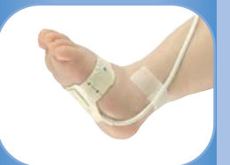
7000N Neonatal Flexi-Form II (< 2 kg / < 4 lbs)