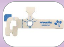
8008JFW Infant FlexiWrap