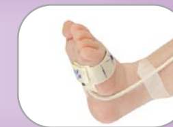
Neonate Flex System (< 2 kg / < 4 lbs)