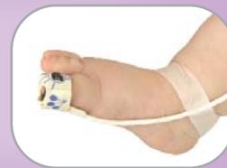
Infant Flex System (2 - 20 kg / 4 - 44 lbs)