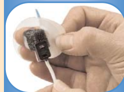
Reflectance Sensor Holder (10 pack w/ 20 adhesive collars)