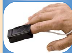
8000K2 Finger Clip (> 30 kg / > 66 lbs)