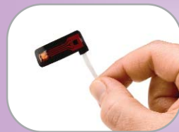
8008J Infant Flex Sensor