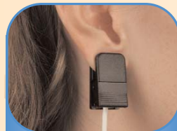
8000Q Ear Clip (> 40 kg / > 88 lbs)