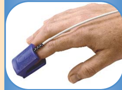
8000AA Adult Finger Clip (> 30 kg / > 66 lbs)