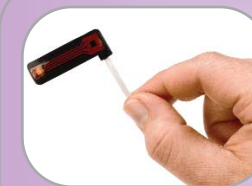
8001J Neonate Flex Sensor