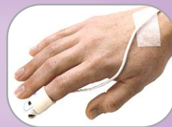
Adult Flex System (> 20 kg / > 44 lbs)