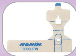
8000JFW Adult FlexiWrap