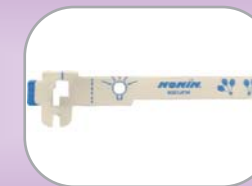
8001JFW Neonate FlexiWrap