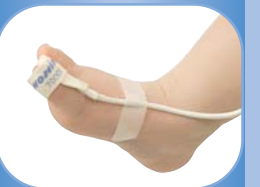
7000I Infant Flexi-Form II (2 - 20 kg / 4 - 44 lbs)