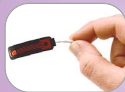
8000J Adult Flex Sensor