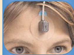
8000R Reflectance (> 30 kg / > 66 lbs)